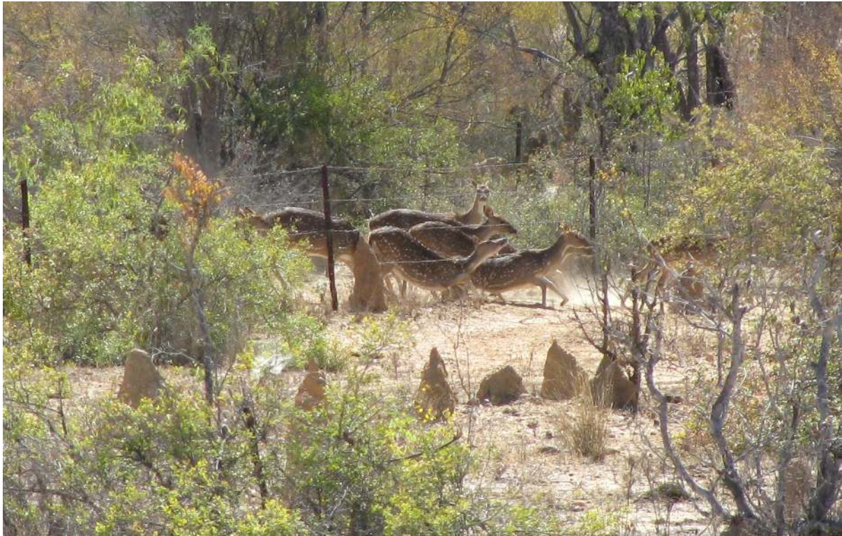
Photo of chital deer pushing under fence